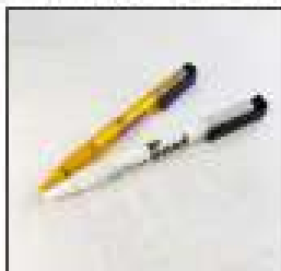
Robinwood Pen - £1.20