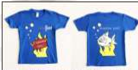
I Survived the Piranha Pool T-Shirt - £12.50