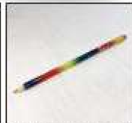
Robinwood Pencil - 60p